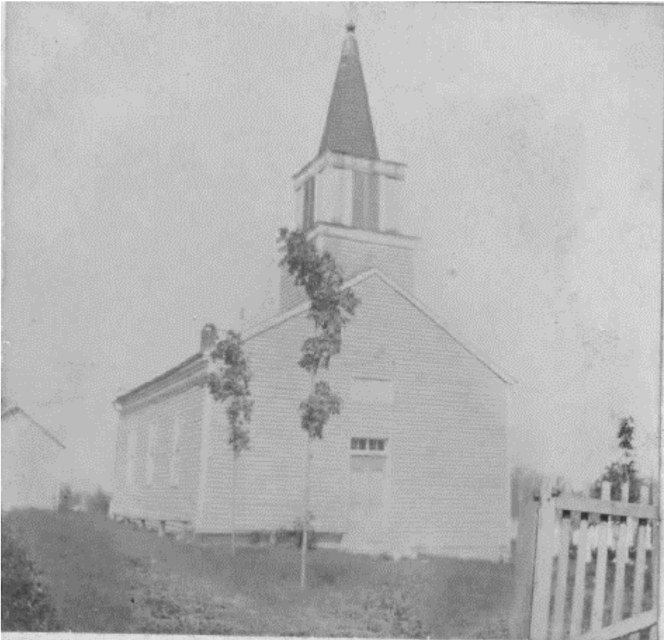
St. John's Evangelical Reformed Church, late 1800's

Also pick up a copy of the “Bits & Pieces” history of St. John’s in the gathering room.